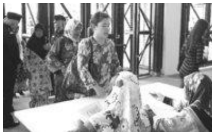
Figure 5. Zakah Management for Empowerment of the Poor

Zakah management's role in contributing to the economy of Brunei Darussalam has long been underestimated. The recent call by His Majesty for an effective zakah distribution has been very well received by the people of Brunei. A few solutions are recommended and the development of a new social model are highlighted that can be exercised by the Institution of Zakah in Brunei Darussalam to achieve the objectives of Syariah as part of its role in eradicating poverty in the country in the next decade. Some recommendations are laid out as follows: management approach, increased awareness, empowerment of the poor.