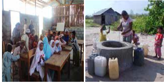
Figure 3. Zakah Mission Community Development at Monkey Island

b. Rumah Pintar dan Pemberdayaan Masyarakat (Smart House and Community Empowerment)