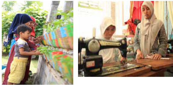
Figure 4. Smart House Pijoengan-BAZNAS Source: BAZNAS, March-April 2013

b. Rumah Pintar dan Pemberdayaan Masyarakat (Smart House and Community Empowerment)